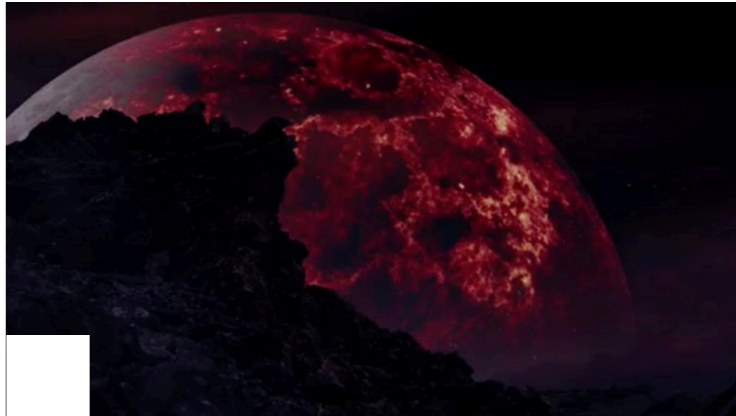
Forces of Nature with Brian Cox

The Moon exists because a planet the size of Mars collided with the early Earth billions of years ago. The crash sent rock and debris into space, where it clumped together to form the Moon. In its early existence, the Moon was a fiery place with active volcanoes spewing lava. Over time, it cooled into the rocky and quiet companion we now see in the night sky.